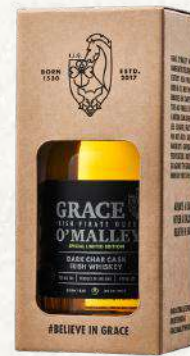
Grace O'Malley® Dark Char Gift Pack