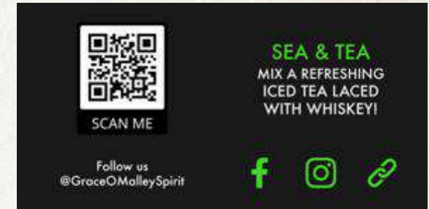
Grace O'Malley® Bottle Neck Tie