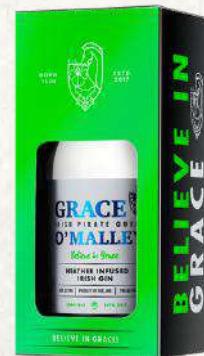
Grace O'Malley® Gin Gift Pack