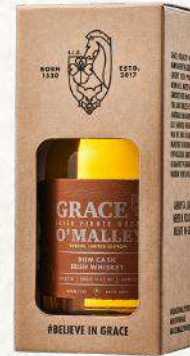
Grace O'Malley® Rum Cask Gift Pack