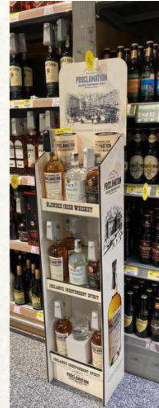
Proclamation® Display Stand