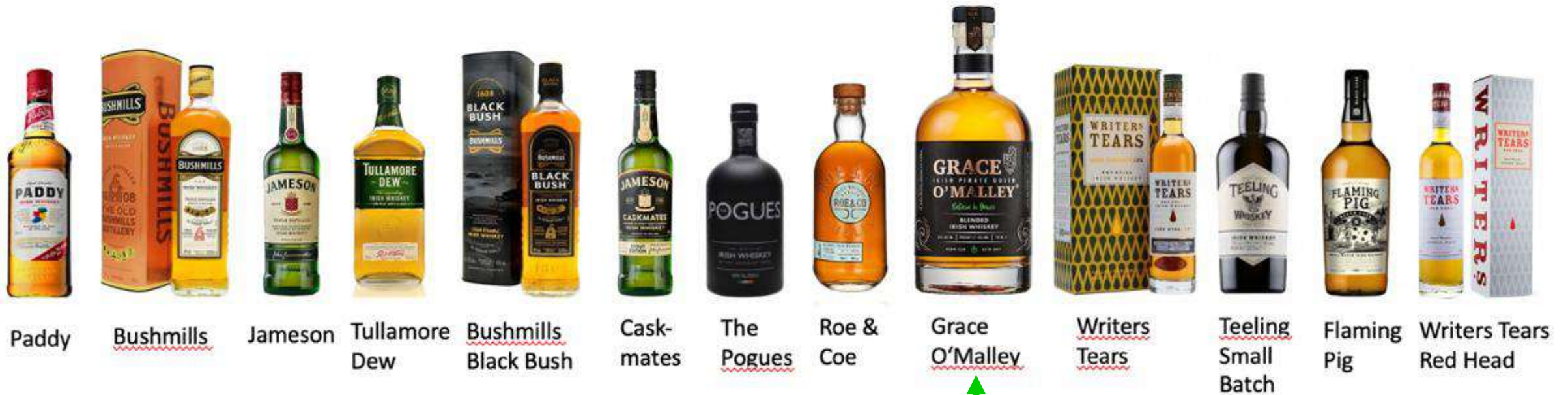
GOM Blended Irish Whiskey Product Positioning