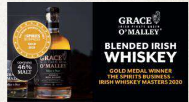
Grace O'Malley® In-store shelf talker display