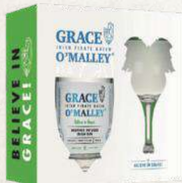
Grace O'Malley® Gin Gift Pack