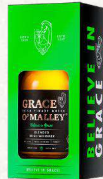
Grace O'Malley® Whiskey Gift Pack