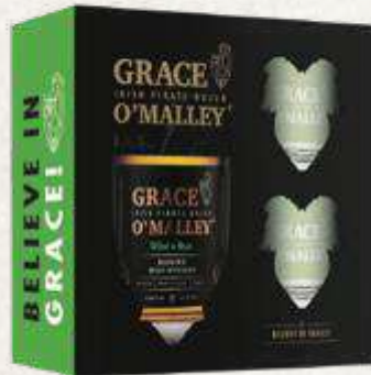
Grace O'Malley® Whiskey Gift Pack